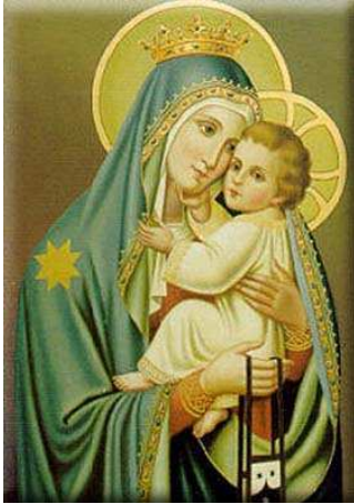
Our patron Saint Mary, Mother of God

According to the church calendar D'Shoonoyeh d'Yoldath Aloho (The Assumption of St Mary) is on the 15th of August. Our church celebrates its Harvest Festival also on the same day. The church instructs its faithful to follow Lent for the preceding 14 days from the 1 st to the 15 th . This has been reduced to 5 days from the 10th to the 15th considering the convenience of the faithful