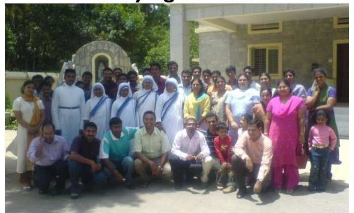
Youth Team at the Missionaries of Charity, Home for Dying Destitute Yelahanka, Bangalore 8th July 2007

None of us knew what to expect or what we intended to do on reaching our destination. Nevertheless all of us armed